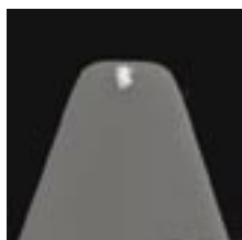
Custom Particle Attachment